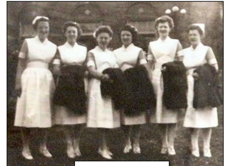
Night shift 1946